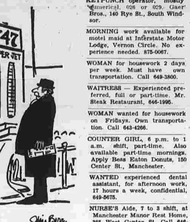
There's no more room in the 'Mature' movie section of the plane, but I CAN give you a window seat in the 'General Audience' movie section!