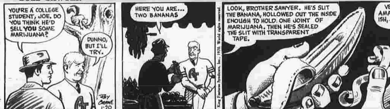
BUZZ SAWYER BY ROY CRANE