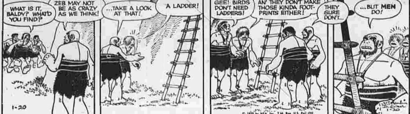
ALLEY OOP BY V. T. HAMLIN