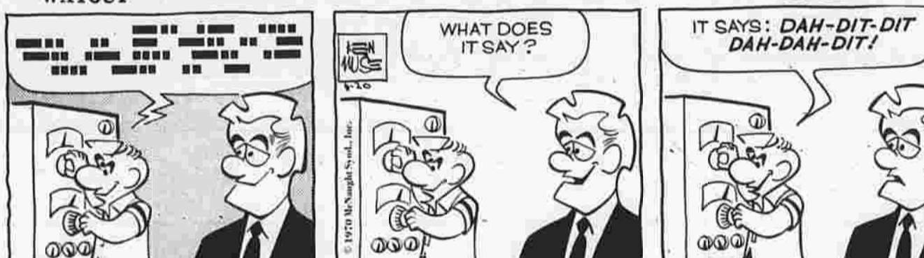
WAYOUT BY KEN MUSE