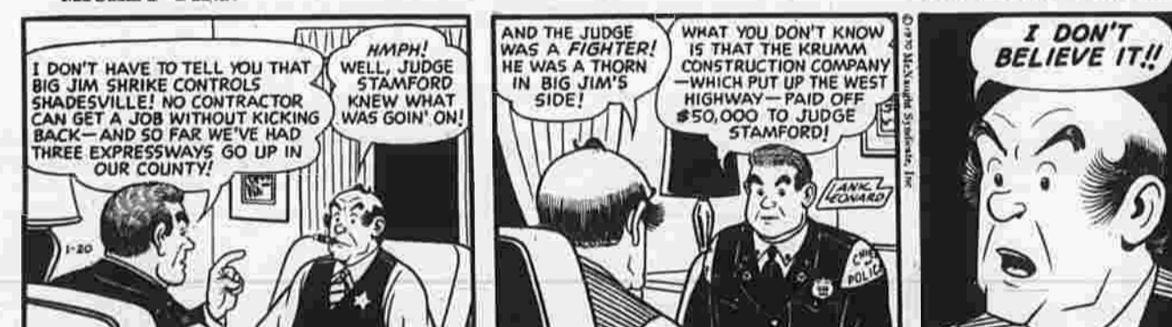
MICKY FINN BY LANK LEONARD